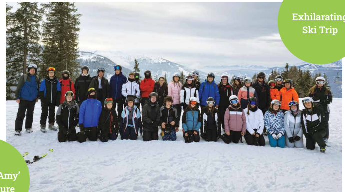
Exhilarating Ski Trip