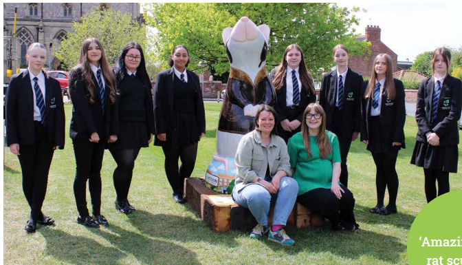
'Amazing Amy' rat sculpture