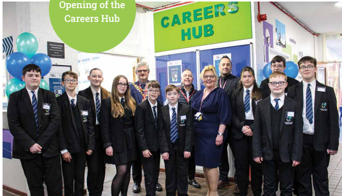
Opening of the Careers Hub